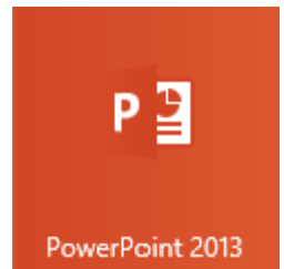
Start Screen View

On Windows 7 PowerPoint could be on your Desktop. If it is not on the Desktop, then go to the Start Menu. You can either search for PowerPoint or go to All Programs > Microsoft Office > Microsoft PowerPoint 2013 .